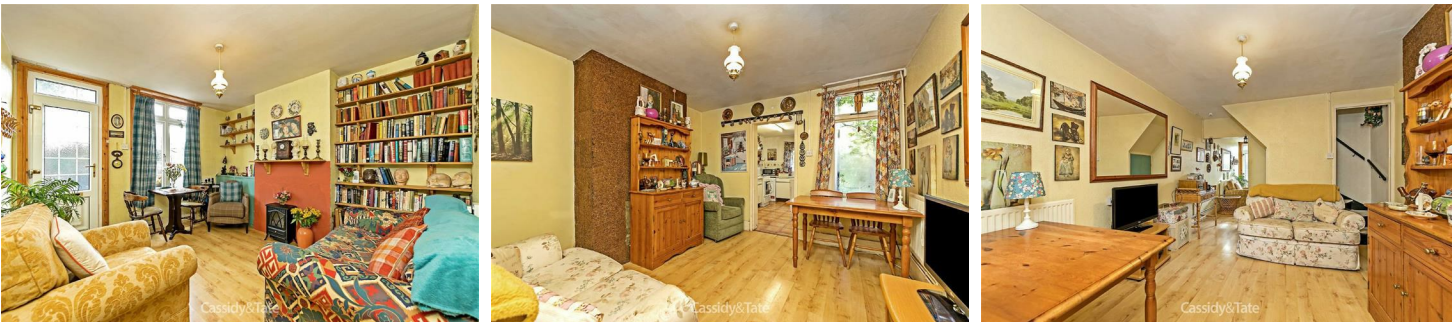
Ground Floor Approx. 35.2 sq. metres (379.0 sq. feet)

Set within the heart of Bernards Heath, in a popular central conservation area is this two bedroom terraced property which is in need of updating. The property has two reception rooms, kitchen, two double bedrooms and a first floor bathroom. Upper Heath Road is situated within the catchment of excellent schools, close to the open spaces of the heath itself and the adjoining woodland. St Albans city centre with its wide range of shops, bars and restaurants and the mainline station are both within walking distance.